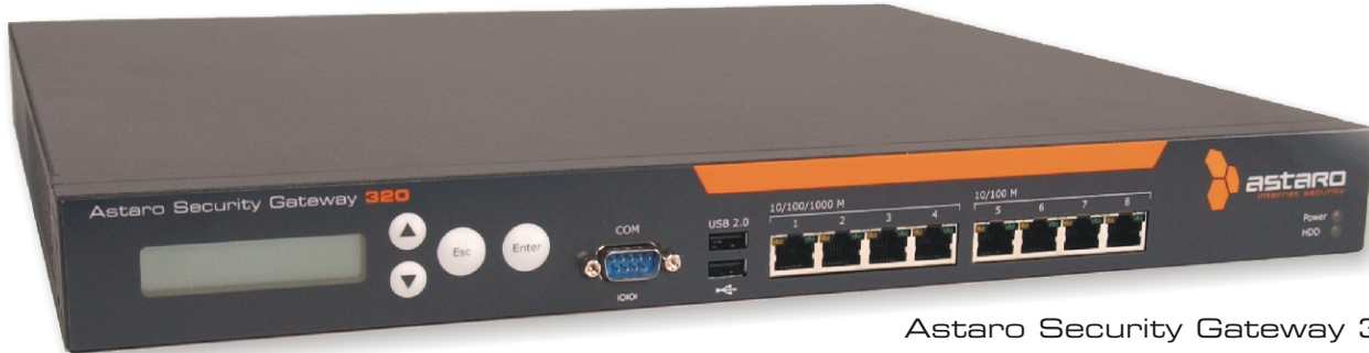
Astaro Security Gateway 320